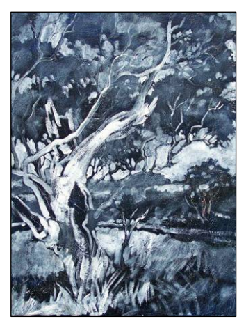
Step 3. Tonal Map.

Use a single colour to create a tonal map of the subject. In this instance the base colour is dark so white paint was chosen. If painting on white gesso a single dark colour would have been selected.