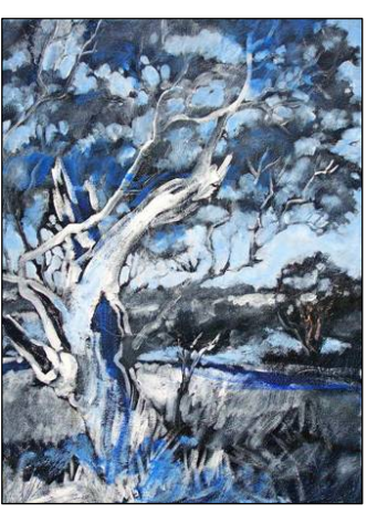
Step 4. Sky.

Use a single colour to create a tonal map of the subject. In this instance the base colour is dark so white paint was chosen. If painting on white gesso a single dark colour would have been selected.