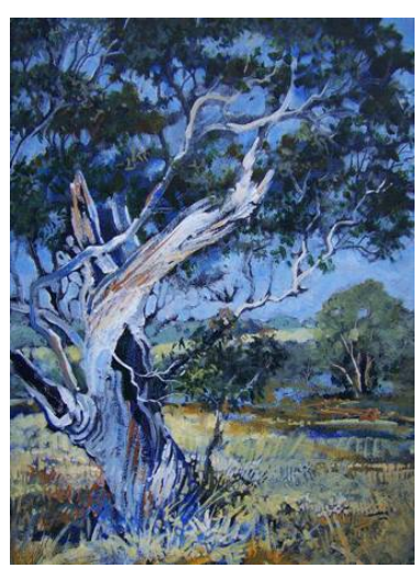
Step 6. More detail

As more colour is added, maintain the tonal pattern already established. The greens are made with Cobalt Blue mixed with the various yellows and/or Red Gold.