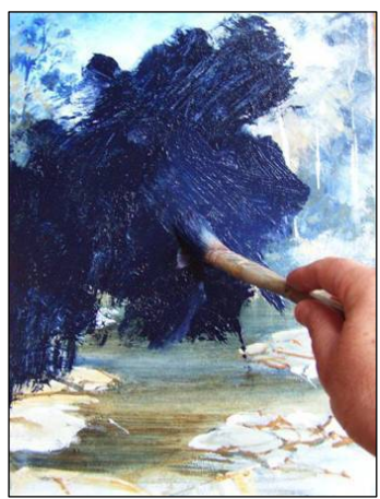
Start with a painting that is no longer wanted and give it a coat of gesso or an opaque colour, to give a